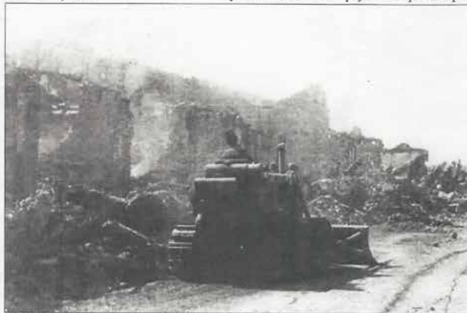
EOH3 Antonio of Seabee Team 1011 clears away bomb damaged structures in Vinh Long, Vinh Long Province; the aftermath of TET '68

-from Text Seabee Team Deployment Completion Report